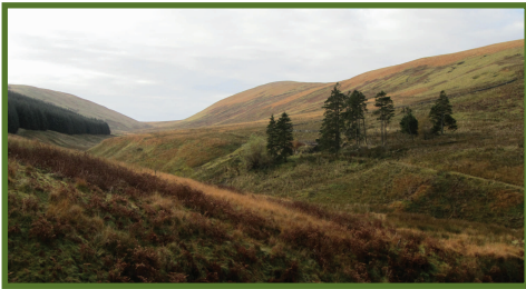
Path rises up to Pikestone Rig