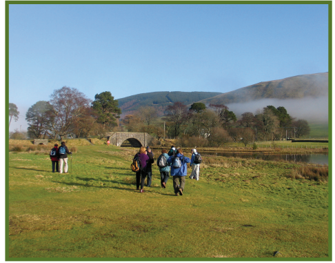
Starting from the Loch of the Lowes

4. From Riskinhope, turn right and follow the shore of the Loch of the Lowes back to the start.