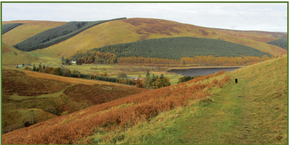
Path descending to Riskinhope and Loch of the Lowes