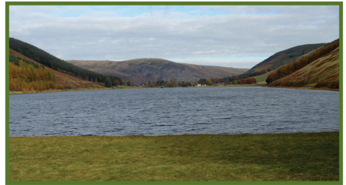
Loch of the Lowes