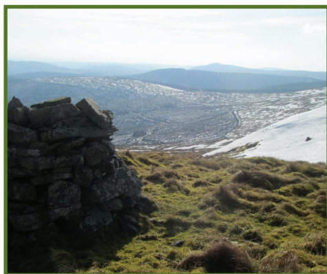
View towards Dumfries &amp; Galloway

4. On leaving the summit, continue to follow the boundary fence north-west for approximately 300yds more, then leave the fence line and head due west to descend the ridge (in clear weather the line of descent is towards the summit of White Shank in the distance). Head down to the Entertrona Burn where you will pick up a good track that will lead down, over a bridge, to Over Phawhope Bothy and from there back to the start.