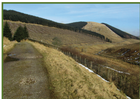
Track heading back to Potburn and start point