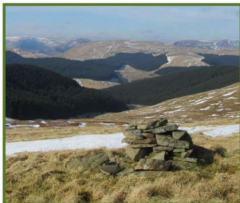
View of head of Ettrick Valley and beyond