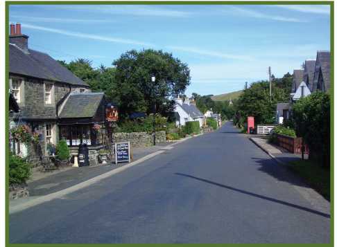
The pretty village of Ettrickbridge